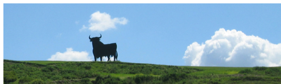
Junta de Castilla y León - Consejería de Educación